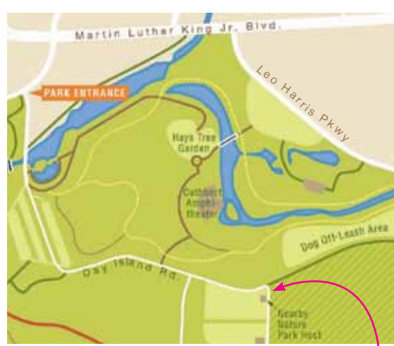
The Water Wise Garden is located next to the Nearby Nature Park Host in Alton Baker Park

University of Oregon urban farm students: volunteer labor